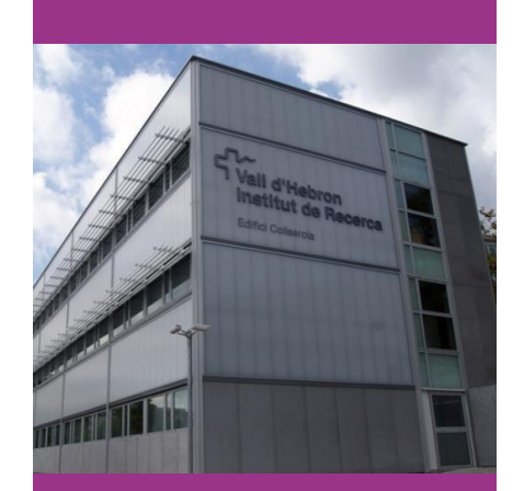
The Vall d'Hebron Research Institute (VHIR) is a public sector institution that promotes and develops the research, innovationand biosanitary teaching of the Vall d'Hebron University Hospital. Through the excellence of our research, we identify and apply new solutions to the health problems of society and we contribute to spread them around the world.