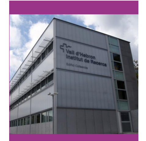
The Vall d'Hebron Research Institute (VHIR) is a public sector institution that promotes and develops the research, innovationand biosanitary teaching of the Vall d'Hebron University Hospital. Through the excellence of our research, we identify and apply new solutions to the health problems of society and we contribute to spread them aroundthe world.