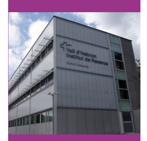
The Vall d'Hebron Research Institute (VHIR) is a public sector institution that promotes and develops the research, innovationand biosanitary teaching of the Vall d'Hebron University Hospital. Through the excellence of our research, we identify and apply new solutions to the health problems of society and we contribute to spread them around the world.