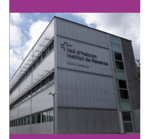
The Vall d'Hebron Research Institute (VHIR) is a public sector institution that promotes and develops the research, innovationand biosanitary teaching of the Vall d'Hebron University Hospital. Through the excellence of our research, we identify and apply new solutions to the health problems of society and we contribute to spread them aroundthe world.