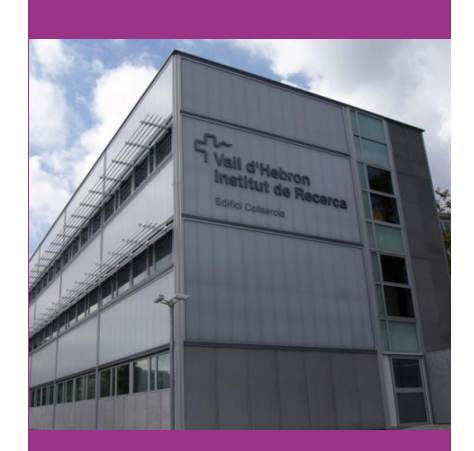
The Vall d'Hebron Research Institute (VHIR) is a public sector institution that promotes and develops the research, innovationand biosanitary teaching of the Vall d'Hebron University Hospital. Through the excellence of our research, we identify and apply new solutions to the health problems of society and we contribute to spread them aroundthe world.