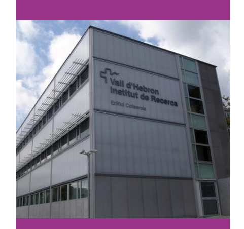
The Vall d'Hebron Research Institute (VHIR) is a public sector institution that promotes and develops the research, innovationand biosanitary teaching of the Vall d'Hebron University Hospital. Through the excellence of our research, we identify and apply new solutions to the health problems of society and we contribute to spread them aroundthe world.