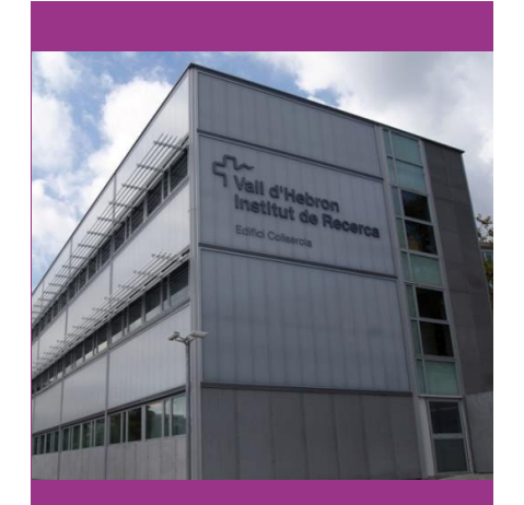
The Vall d'Hebron Research Institute (VHIR) is a public sector institution that promotes and develops the research, innovationand biosanitary teaching of the Vall d'Hebron University Hospital. Through the excellence of our research, we identify and apply new solutions to the health problems of society and we contribute to spread them aroundthe world.