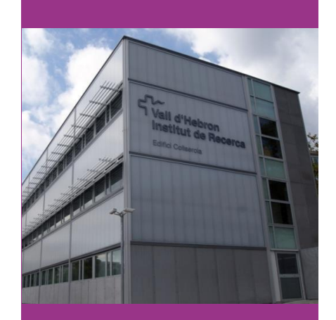
The Vall d'Hebron Research Institute (VHIR) is a public sector institution that promotes and develops the research, innovationand biosanitary teaching of the Vall d'Hebron University Hospital. Through the excellence of our research, we identify and apply new solutions to the health problems of society and we contribute to spread them aroundthe world.