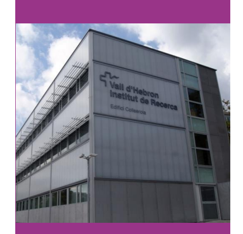
The Vall d'Hebron Research Institute (VHIR) is a public sector institution that promotes and develops the research, innovationand biosanitary teaching of the Vall d'Hebron University Hospital. Through the excellence of our research, we identify and apply new solutions to the health problems of society and we contribute to spread them aroundthe world.