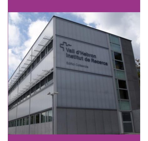
The Vall d'Hebron Research Institute (VHIR) is a public sector institution that promotes and develops the research, innovationand biosanitary teaching of the Vall d'Hebron University Hospital. Through the excellence of our research, we identify and apply new solutions to the health problems of society and we contribute to spread them aroundthe world.