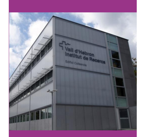
The Vall d'Hebron Research Institute (VHIR) is a public sector institution that promotes and develops the research, innovationand biosanitary teaching of the Vall d'Hebron University Hospital. Through the excellence of our research, we identify and apply new solutions to the health problems of society and we contribute to spread them aroundthe world.